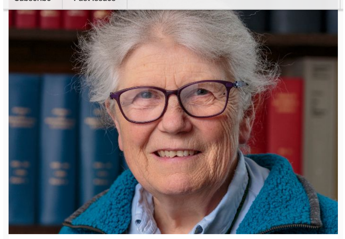
<u>PIMS - UManitoba Distinguished Lecture: Elizabeth</u> <u>Thompson</u>