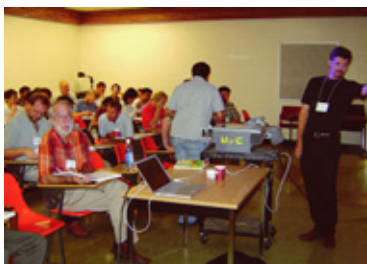
Participants hard at work at the SISS

Finally, Mauricio Sacchi (University of Calgary) gave a lucid set of lectures on the imaging problem from the perspective of mathematical inverse theory, emphasizing the utility of adjoint methods over full inversion and showing how regularization methods can be used to control the trade-off between resolution and uniqueness.