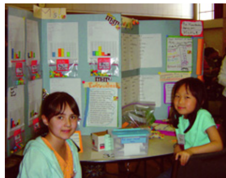
Two participants at FAME 2006

There are three levels: elementary (grades K to 5), middle (grades 6 to 8) and senior (grades 9 to 12). The winning elementary school had students from grades 2 and 3. Entries are judged and prizes are awarded for the best exhibits.