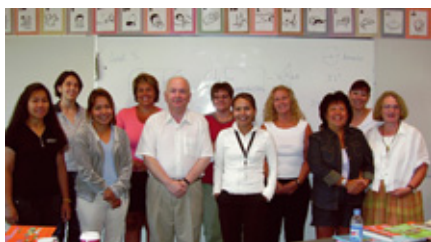
Teachers at the Sk'elep School of Excellence training in 2005

Many enquiries came from educators who talked to the teachers at Sk'elep; they seemed pleased with our efforts. As a result, in June, 2005, PIMS organized a four-day teacher training-math development session at Lytton, attended by 19 teachers from several schools around the Fraser Valley area and Kamloops. We also held an additional two-day training and math development session at Neqweyqwelsten School in Barriere in August, where teachers from Sk'elep at Kamloops and other schools in the surrounding areas will attend. Teachers who came to our session in Lytton found it enriching as well as