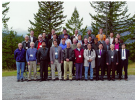
Pacific Rim Mathematical Forum participants at Banff International Research Station