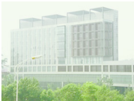
Chern Institute in Nankai