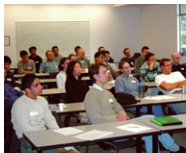
Pims postdocs listen to the speakers at the 2005 Postdoc Day