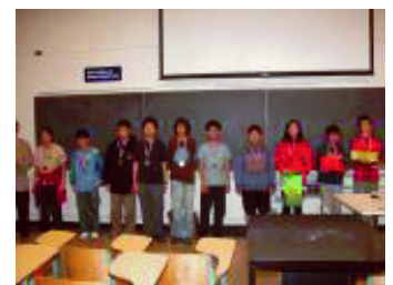
(top to bottom): Winners for ELMACON 2006 for Grades 5-7