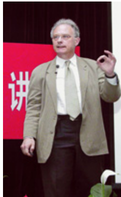
Ivar Ekeland presenting a public lecture at the Chern Institute

A meeting was also held with the head of the mathematics section of the National Natural Science Foundation of China (NSFC), to establish and promote links within the PRIMA network.