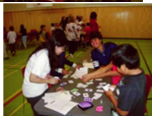
Students tackle math problems at Math Mania events in Lytton and Sk'elep