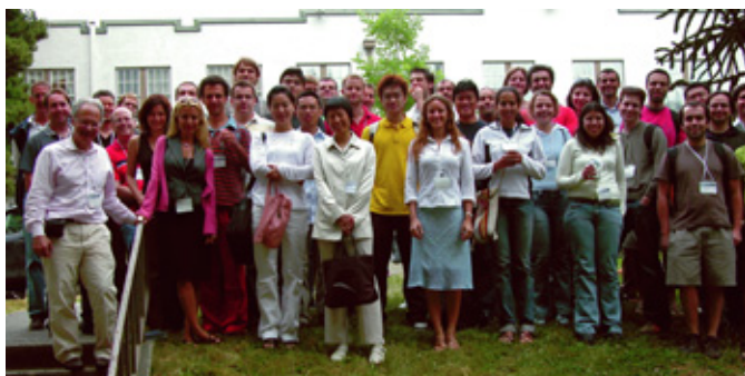
PIMS Frontiers in Mathematics and Economics Summer School participants at the welcoming barbecue.