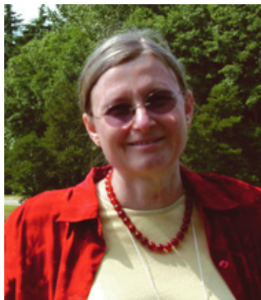
Mathematician Ingrid Daubechies