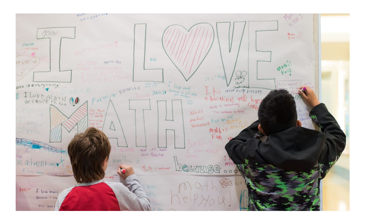
See Nomination Details